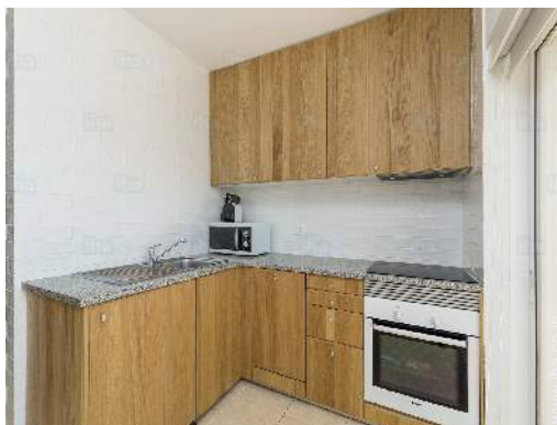
Guest facilities and furnishings