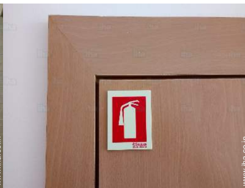
Equipment at the guest's disposal