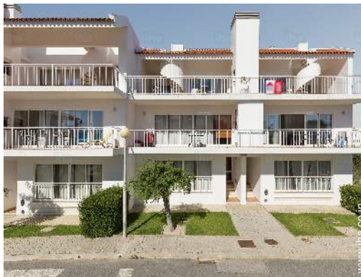
Modern block of flats