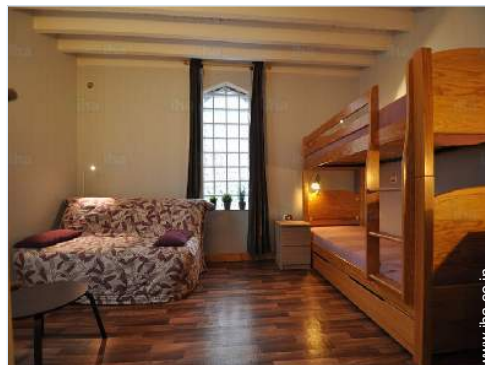
Sleeps - bed(s)