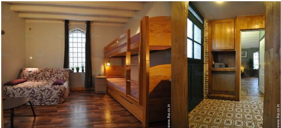
Sleeps - bed(s)