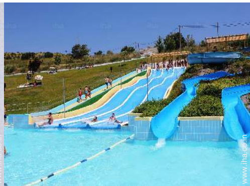
leisure pursuits nearby