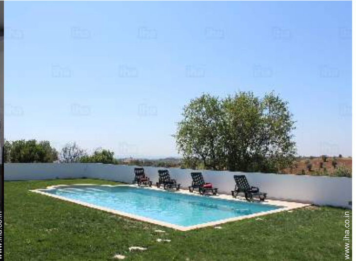
Rectangular swimming pool