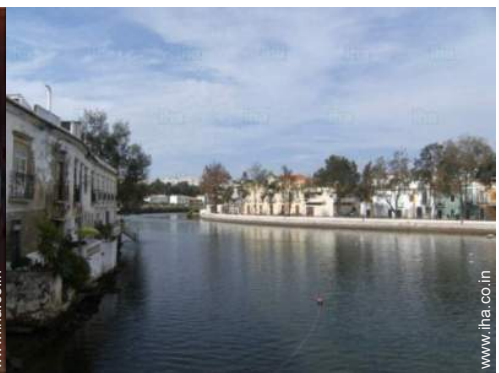
Towns close by