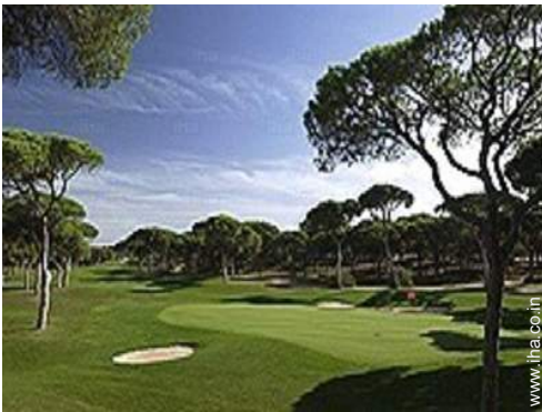
18 hole golf course