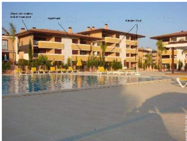
Rectangular swimming pool